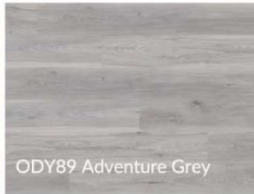
ODY89 Adventure Grey