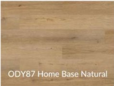
ODY87 Home Base Natural