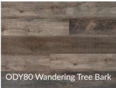
ODY80 Wandering Tree Bark