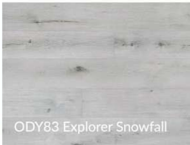
ODY83 Explorer Snowfall