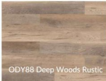
ODY88 Deep Woods Rustic