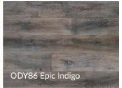
ODY86 Epic Indigo