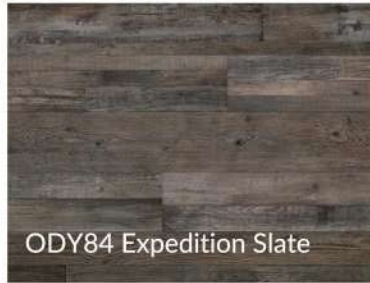
ODY84 Expedition Slate