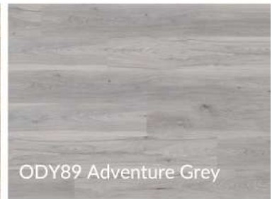
ODY89 Adventure Grey