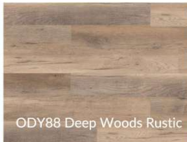
ODY88 Deep Woods Rustic