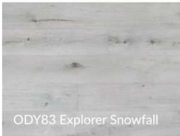
ODY83 Explorer Snowfall