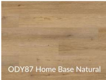
ODY87 Home Base Natural