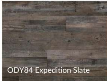
ODY84 Expedition Slate