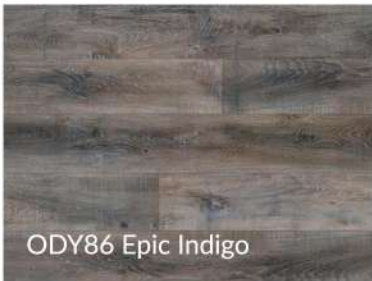
ODY86 Epic Indigo