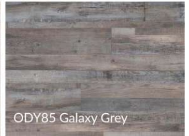
ODY85 Galaxy Grey